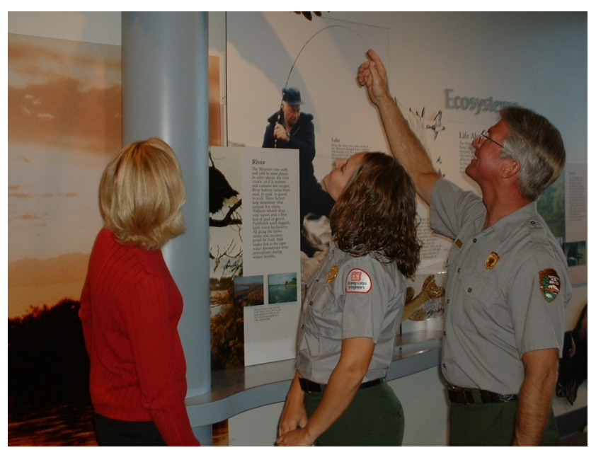
Corps and NPS staff discussing displays at the Lewis and Clark Visitor Center.