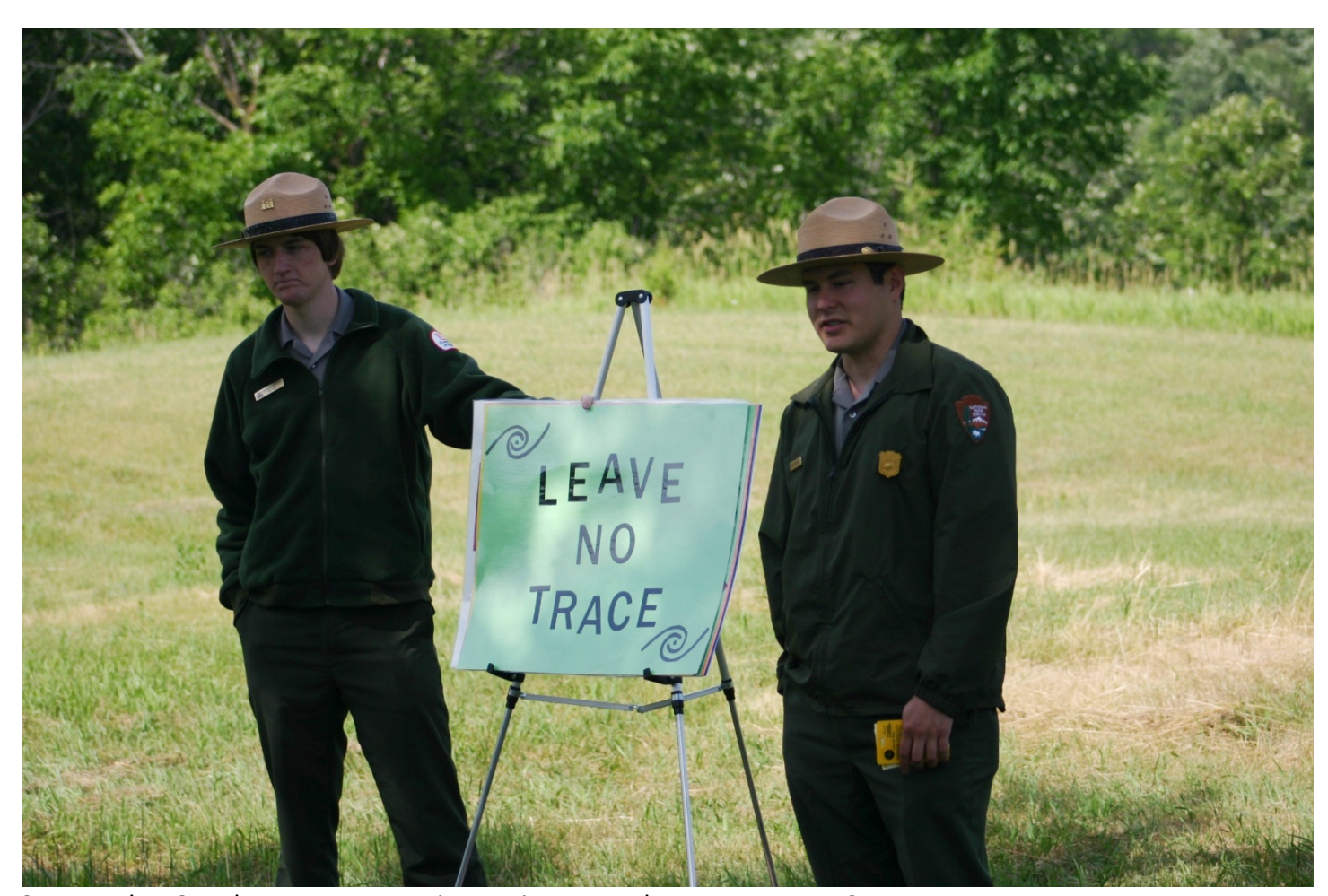
Corps and NPS park rangers presenting environmental program to Boy Scout group.

The Corps of Engineers at Gavins Point Project has partnered with the National Park Service to operate the Lewis and Clark Visitor Center. The partnership enables the Corps and Park Service staff to work together at this Class A visitor center to provide quality environmental education and outreach programs and activities, extend hours of operation, and enhance the O&M (Operations and Maintenance) of visitor center facilities and exhibits that promote both partners. The two agencies work together to plan strategies and implement activities related to promoting good environmental stewardship at Gavins Point Project and the Missouri National Recreation River. This partnership allows the opportunity to pursue challenge cost share agreements, grants and other funding opportunities and agreements for the purpose of promoting initiatives that serve to educate the public more efficiently and effectively.